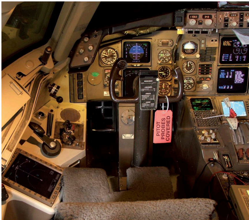
In UPS's 757, SafeRoute functions are hosted on sidewall-mounted class 3 EFB displays