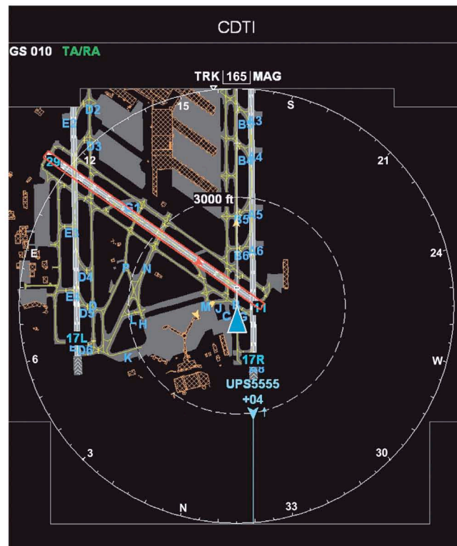
Own-ship position is shown on the airport diagram as a triangle. Red highlights an incursion threat, as target (red chevron) moves down the runway